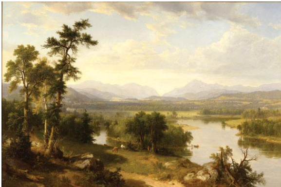
Asher B. Durand White Mountain Scenery, Franconia Notch, New Hampshire, 1857 The New-York Historical Society, New York City

Do you think utopian communities are possible? Why or why not?