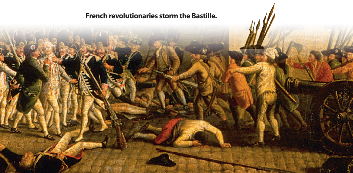
French revolutionaries storm the Bastille.

The storming of the Bastille was one of the first acts of the French Revolution —a rebellion of French people against their king in 1789. The French people overthrew their king and created a republican government.