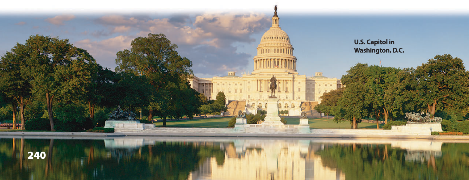
U.S. Capitol in Washington, D.C.

Hamilton and Jefferson also fought over how the country's economy should grow. Hamilton wanted new forms of economic growth. He wanted to promote manufacturing and business. He even suggested that the